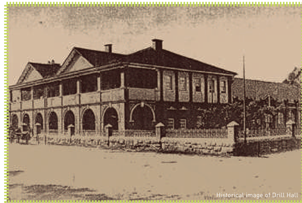
Historical image of Drill Hall

leaders of different parties and races gathered daily at the Drill Hall proceedings at a time when political and multi racial meetings were outlawed. The trial has thus been described as “the longest uninterrupted meeting in the history of the struggle.” The trial is also significant for convincing some of the struggle leaders, including Mandela, that peaceful resistance against apartheid would no longer work.